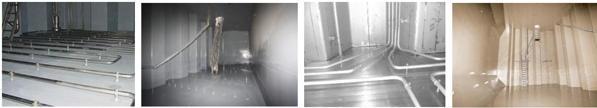
Figure 1. Tank coatings; epoxy (a), zinc silicates (b), stainless steel (c), MarineLine (d).